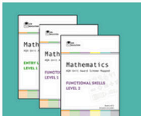
Maths Workbooks (with AQA UAS Certification)