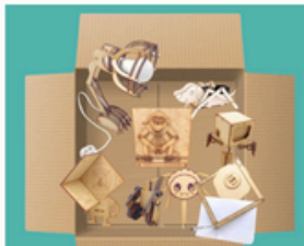
Eco friendly STEM project kits (3 difficulty levels)