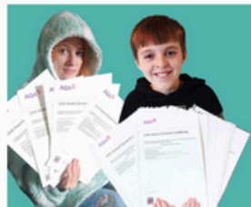
AQA UAS: 30 units per term of the learner's choice