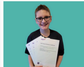
AQA Unit Award Scheme certification