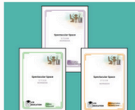
S.T.E.A.M. Workbooks (with AQA UAS Certification)