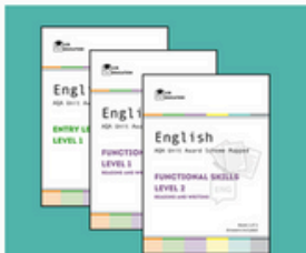
English Workbooks (with AQA UAS Certification)